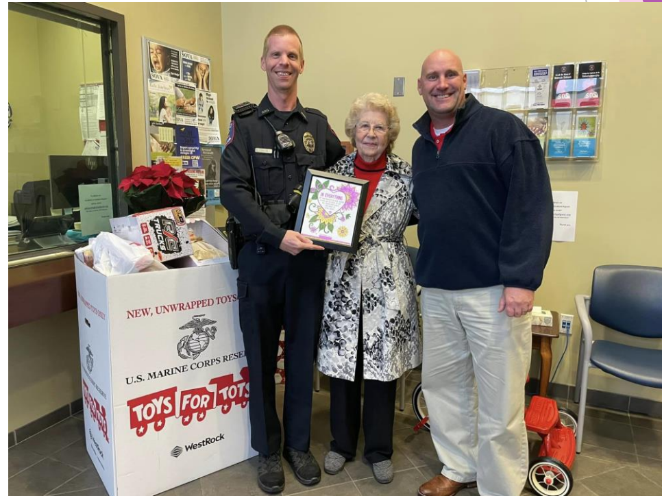
Gardens at Eastside, Greenville, SC- Cops for Tots